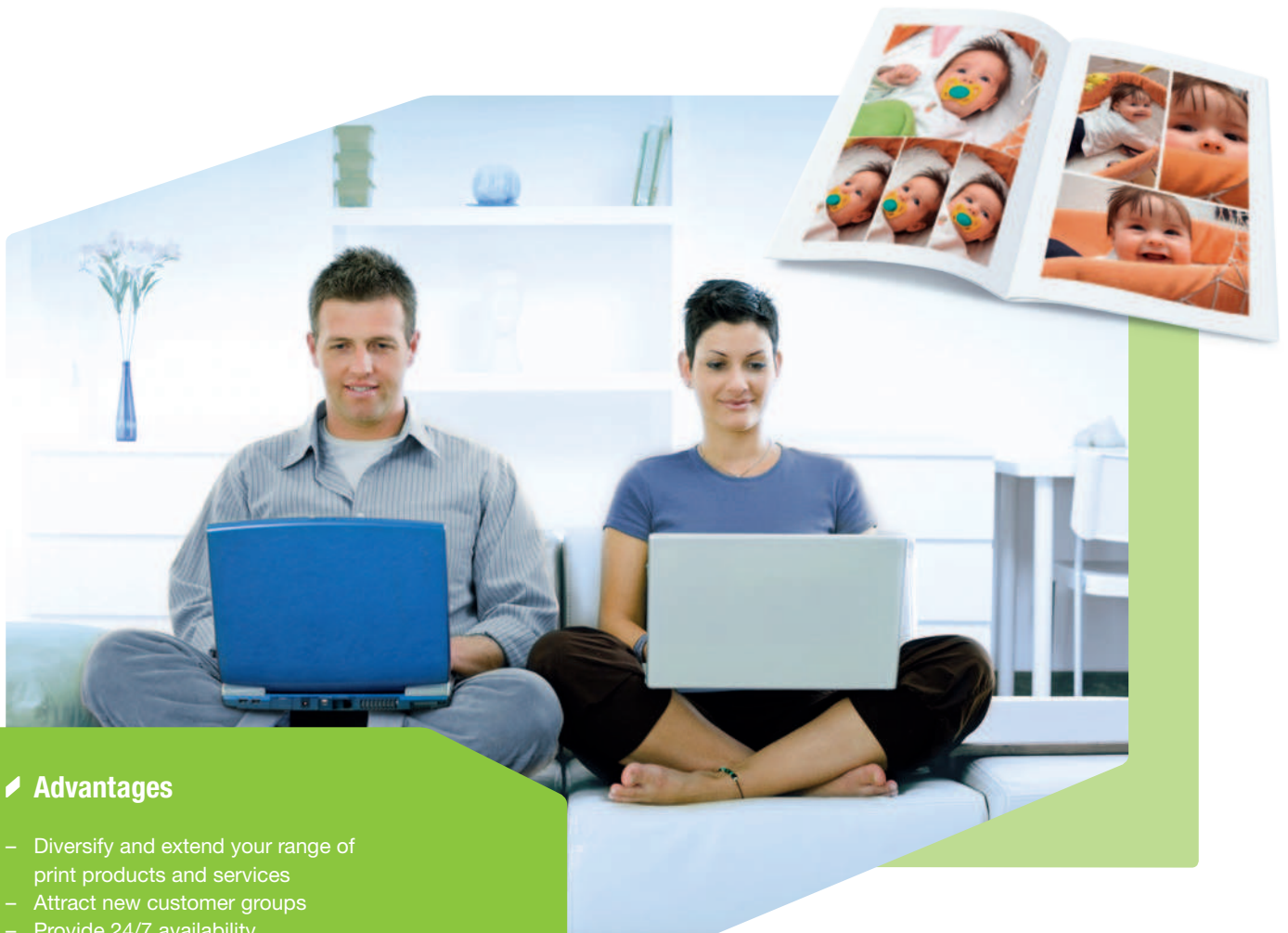
Photo book creation is an easy and attractive enhancement of your online print offering. Via a photo book application, you provide your customers with easy yet extensive online layout possibilities to create albums or calendars with their photos of holidays, events and other occasions. Similar to other web-to-print applications, photo book software includes online submission, payment and tracking, right down to the final delivery or collection of the printed photo book.

“Expand your services and grow your revenue.”